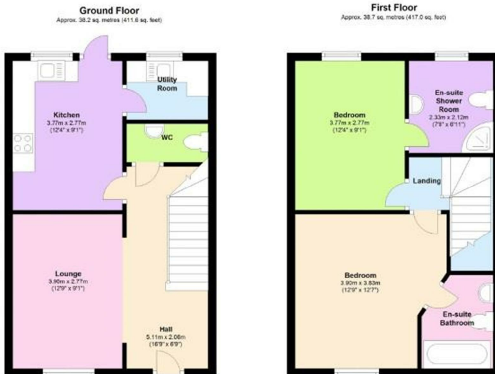
Total area: approx. 77.0 sq. metres (828.6 sq. feet)

Bournemouth Energy Floor Plans are provided for illustration/identification purposes only. Not drawn to scale, unless stated and accept no responsibility for any error, omission or mis-statement. Dimensions shown are to the nearest 7.5 cm / 3 inches. To find out more about Bournemouth Energy please visit www.bournemouthenergy.co.uk (Tel: 01202 532500)